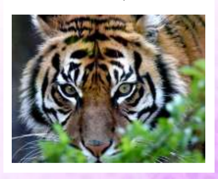
REGENTA CENTRAL HERALD BANNIMANTAP, MYSORE

Regenta Central Herald is the city's finest business hotel, designed to pamper even the busiest of executives. Strategically located in a rapidly developing commercial area, it is in close proximity to railway station, palace, zoo and historic places.