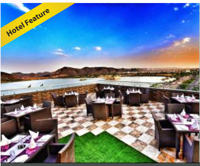
THE ROYAL TERRACE @ Regenta Central Jalmahal, Jaipur

ISSUE NO. 03 APRIL 2018 www.royalorchidhotels.com